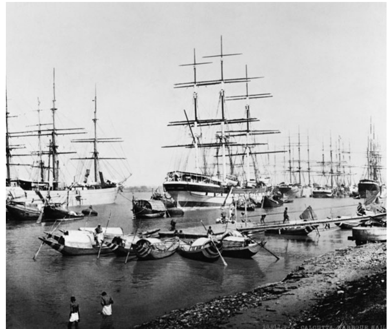
British sailing ships in Calcutta Harbor, c. 1860

Industrialization came to the United States in 1789. Samuel Slater left Britain for Rhode Island. He set up the first textile factory on U.S. soil. He couldn't bring any notes or plans from Britain. Slater had to set up the factory from memory.