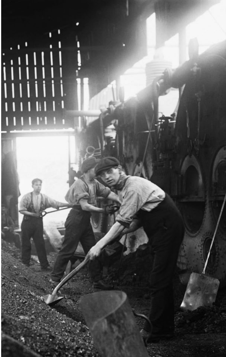
Workers shovel coal in England, 1912