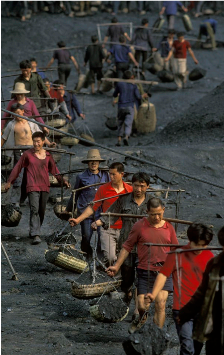
Workers haul coal to waiting barges near Fengjie, China, 2005

Industrialized nations used their strong armies and navies to colonize many parts of the world that were not industrialized. They needed raw materials for their factories. This colonization is known as imperialism. In 1800, Europeans occupied or controlled about 34 percent of the land surface of the world. By 1914, this had risen to 84 percent.