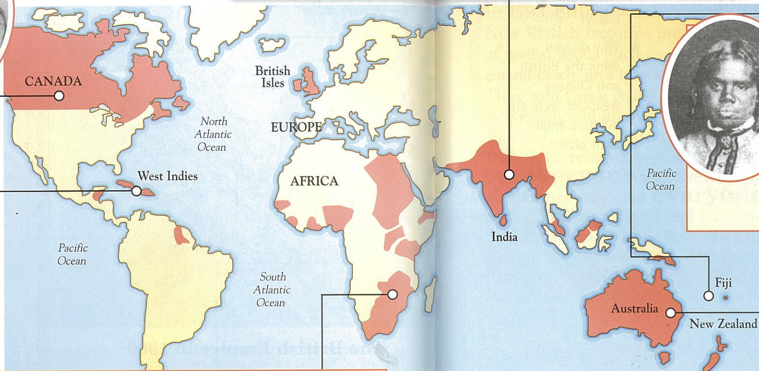
The British Empire in 1900

"I was a teacher. I came from an aborigine family but I went to a school run by white Australians who had followed Edward Gibbon Wakefield's advice to come to this land. I was taught to be a Christian and to forget aborigine beliefs. At first I was happy to follow the ways of white people. Soon I was teaching other aborigine girls how to count, read, sew, cook and wash for white women. My husband taught aborigine boys about gardening and outdoor work. Later I turned against this way of life – why should aborigines only be trained for the lowest jobs of all?"