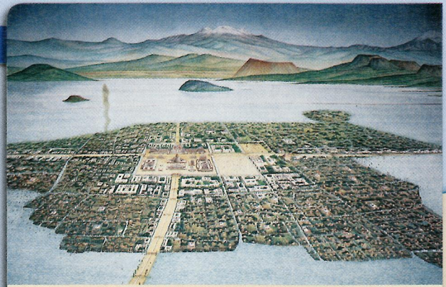
The Aztecs' magnificent capital, Tenochtitlán, was built on an island in Lake Texcoco.