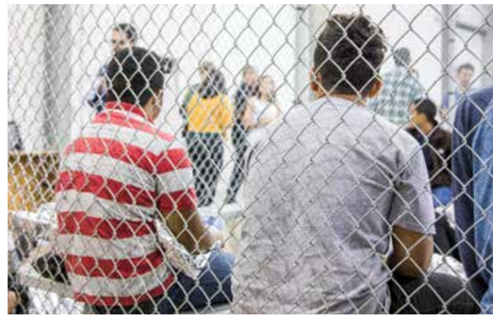
Immigrant children and adults await processing at a U.S. Customs and Border Protection facility in McAllen, Texas, last year (above and at right).

Most of these immigrants are from Guatemala,