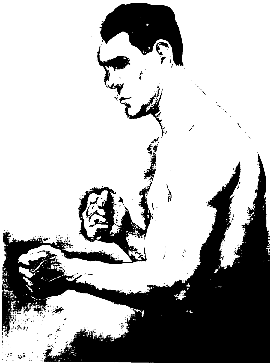
A portrait of Max Schmeling by George Grosz from 1926. The boxer, who was world heavyweight champion in 1930-32, seemed to embody Hitler's views about Aryan superiority, but he disassociated himself from the Nazis. During Kristallnacht he protected two teenage Jewish boys in his Berlin hotel room, later helping to smuggle them out of Germany.

Hitler perceives Brest-Litovsk as 'immensely humane', and contrasts it with the Treaty of Versailles, 'an act of highway robbery against our people.'