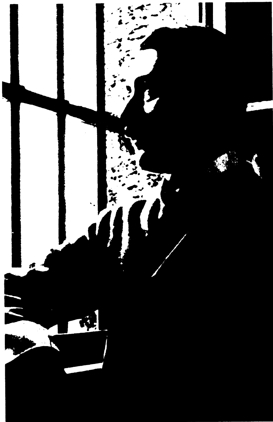
Adolf Hitler poses for the camera, Landsberg Fortress. His cell, according to one visitor, 'looked like a delicatessen'. Here he not only dictated Mein Kampf but decided on new tactics for the Nazis: 'We must hold our noses and enter the Reichstag'.

The book promotes Hitler's ardent and muddled nationalism which seeks to reinvent Germanic myths: Mein Kampf is the work of a convinced anti-Semite who managed to weave his Jew-hatred into his views on the postwar peace treaty of 1919, the