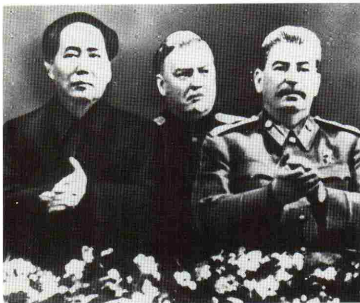
(Left) Mao with Stalin in Moscow in 1950. Marshal Bulganin stands behind them.

Secondly, even before Khrushchev's secret speech of February, 1956, Mao Zedong and the Chinese leadership had been discussing measures for improving both the morale and the standard of living of the intellectuals inherited from the old society, in order to secure their active and willing participation in build-