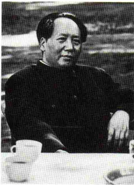
Mao Zedong photographed in Beijing in 1949, shortly after assuming power as first Chairman of the People's Republic of China.

China as offering an alternative pattern, possibly more suited to Asian conditions. The decision of the Paris Peace Conference to hand the former German concessions in Shandong to Japan, rather than return them to China, contributed to the disillusionment with the West, and called forth student demonstrations in Peking on May 4th, 1919, which have given a name to this period of rapid and decisive change, now commonly known as the 'May Fourth Era'.