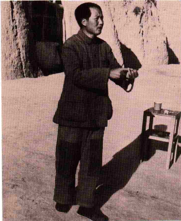
(Left) Mao lectures in Yan'an, 1942, and (below) talks with some 'little devils' of the eighth Route Army at Yan'an, 1939.

In 1939-40, Mao coined the term 'New Democracy' to characterise the current stage of the Chinese revolution. This concept was largely derived from the ideas of Lenin regarding a 'bourgeois-democratic' stage in the political development of relatively backward countries such as Russia, during which the Communist Party would exercise power in the name of the proletariat, while not pursuing explicitly socialist goals. Lenin had referred, in 1905, to the 'Revolutionary-Democratic Dictatorship of the Workers and the Peasants'. Mao, summing up in June, 1949, the conception he had elaborated during the intervening decade of internal and external struggles, culminating in three years of renewed