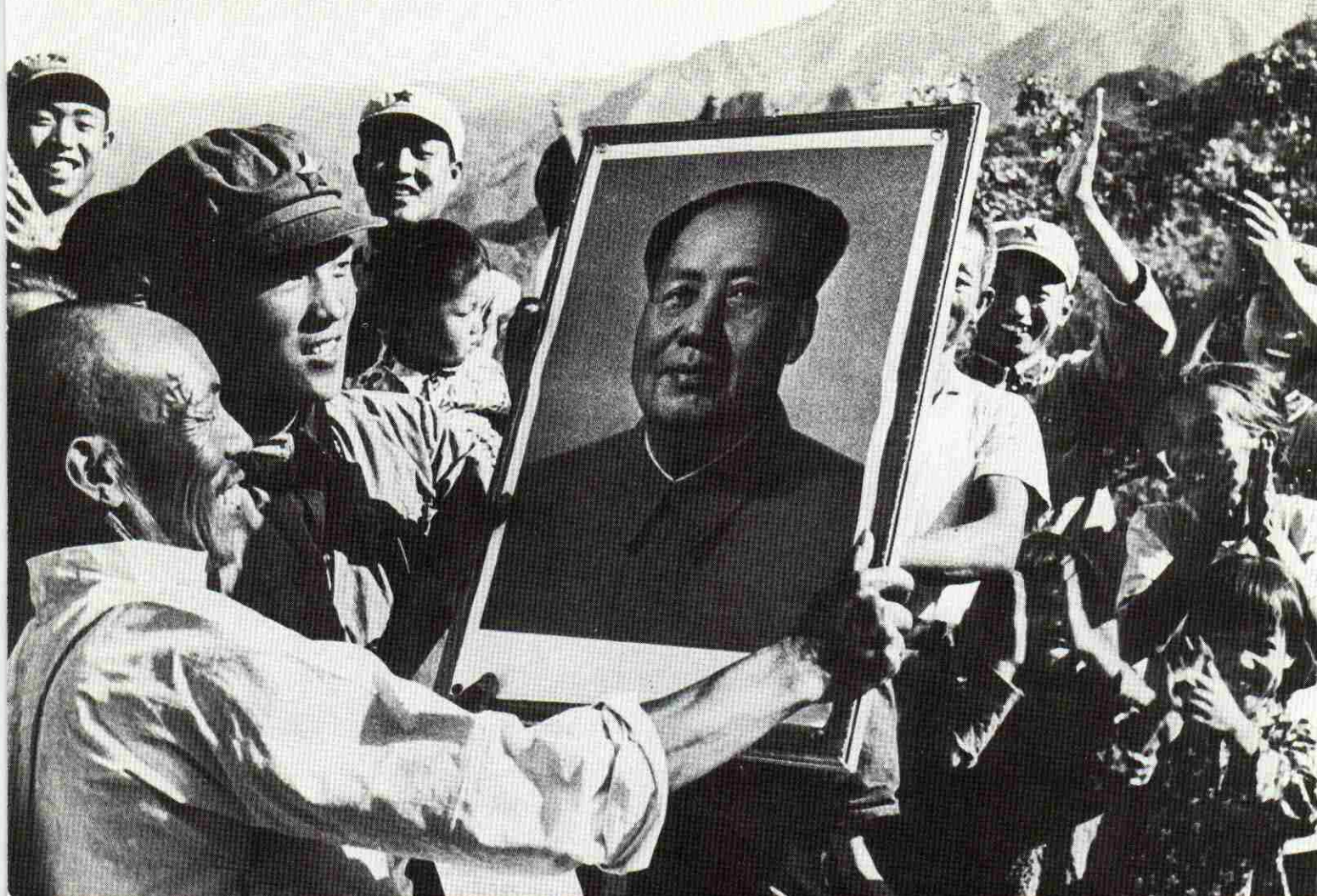
Men of the People's Liberation Army join with peasants in admiration of Mao Zedong's portrait.