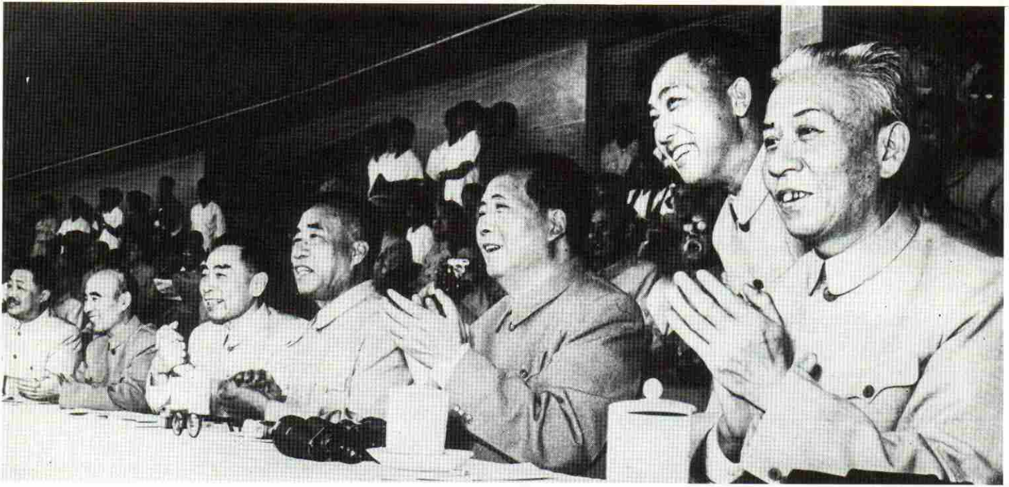
The Chinese leadership at the first National Games in Beijing, September, 1959. Left to right: He Long, Lin Biao, Zhou Enlai, Zhu De, Mao Zedong, Liu Shaoqi.

fended his policies - in particular the communes. By spring, 1959, he had acknowledged that some adjustments were necessary, including decentralisation of ownership to the constituent elements of the communes (teams and brigades), and reduction in their size to more human and manageable proportions. But he insisted, against the almost unanimous opinion of other Party leaders, that the concept of the communes, and the belief that China, though 'poor and blank', could leap ahead of other countries, were basically correct. Only Peng Dehuai, the Minister of Defence, was bold (or naive) enough, among all the top leaders, to challenge Mao openly at the Lushan meeting of July-August, 1959, but the others saw the handwriting on the wall, and henceforth the conflict was irreconcilable.