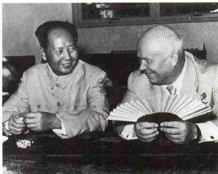
(Right) Khrushchev with Mao on his visit to China in July, 1958.

Against this background the 'Great Leap Forward' was launched in 1958. While the policies of this period marked a sweeping and open departure from the Soviet model, they were by no means so one-sided and simplistic as they have commonly been made out to be in recent years. Mao placed stress equally on moral and material incentives, on 'redness' and expertise, and on large- and small-scale industry. The policy of 'walking on two legs', which was at the heart of his whole economic strategy, was a policy of walking as fast as possible on both of these legs, and not of hopping along on the leg of small-scale indigenous methods alone. In no sense was Mao a partisan (like some of his admirers in the West) of a 'steady-state' or planned zero-growth economy. On the contrary, throughout the twenty-seven years during which he presided over the destinies of the Chinese People's Republic, Mao never ceased to call for rapid economic