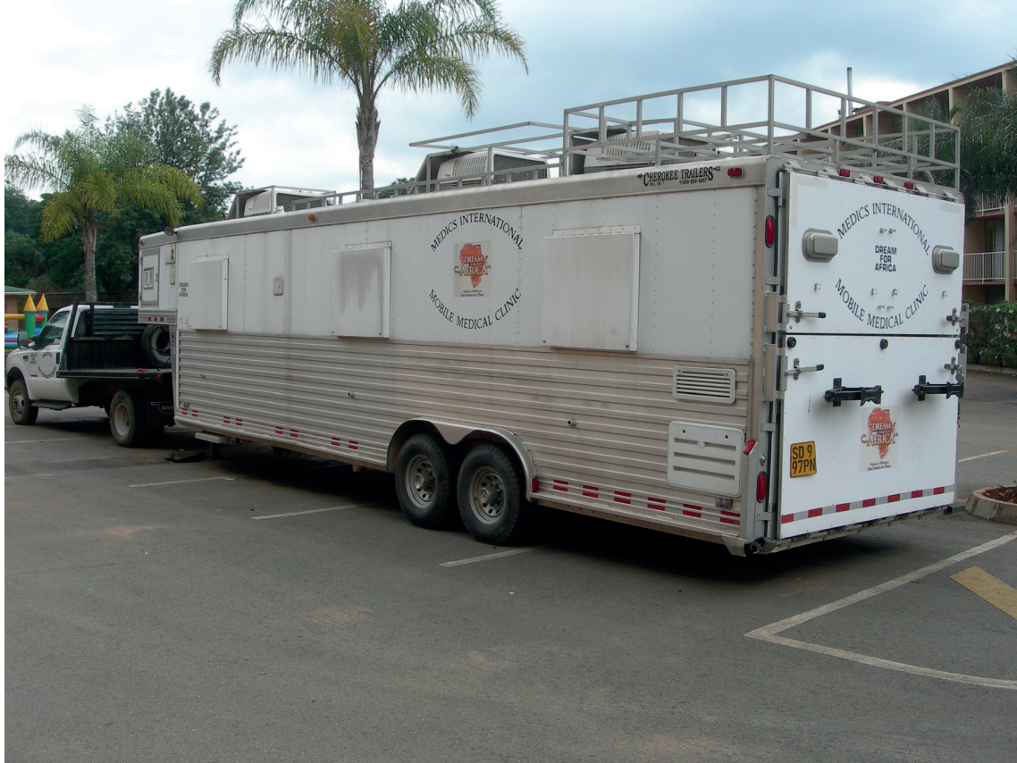
Photograph A for Question 2