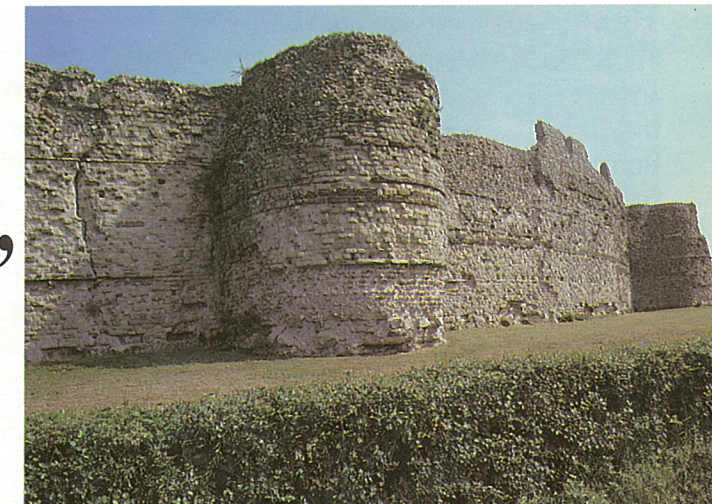
SOURCE 7 Border security was increased all over the Empire. Even in far-away Britain in the fourth century, the Romans built a series of coastal defences called the forts of the Saxon shore. This one is Pevensey Castle in Sussex

The Roman road system, which had served the Roman army so well when they were always on the attack, had allowed invaders to push deep into the Empire as soon as they got through the walls.