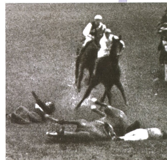
1913: Death at the races. SUFFRAGETTE dies for the right to vote for her Member of Parliament.