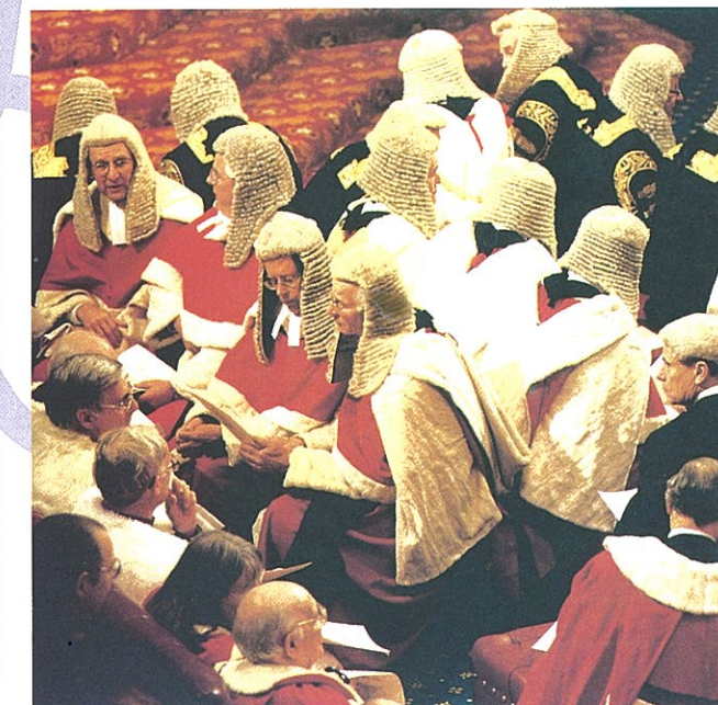
2000: The Commons discuss abolishing the Lords. Another battle over Parliament.