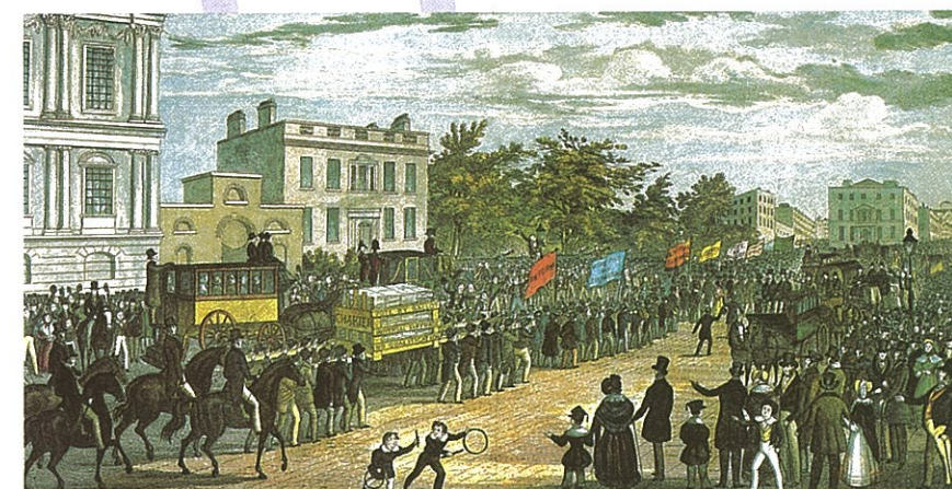
1840s: Millions sign Charter. Every man wants the chance to vote for a Member of Parliament.