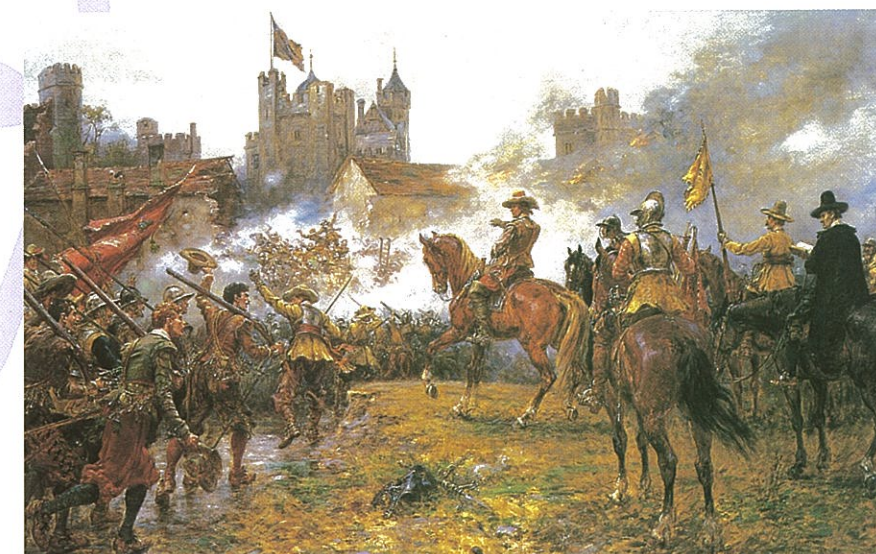
1640s: King fights Parliament. Who will rule the country?

These four pictures have something in common. What is it?