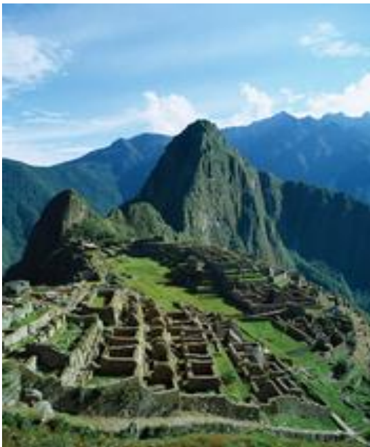
The city of Machu Picchu may have been a religious center during the Inca Empire.

This remarkable relay system helped the Incas manage their far-flung empire. In this chapter, you will explore how the Incas built and maintained their empire. You will also learn about the Incas' class structure, family life, religion, and relations with other peoples.