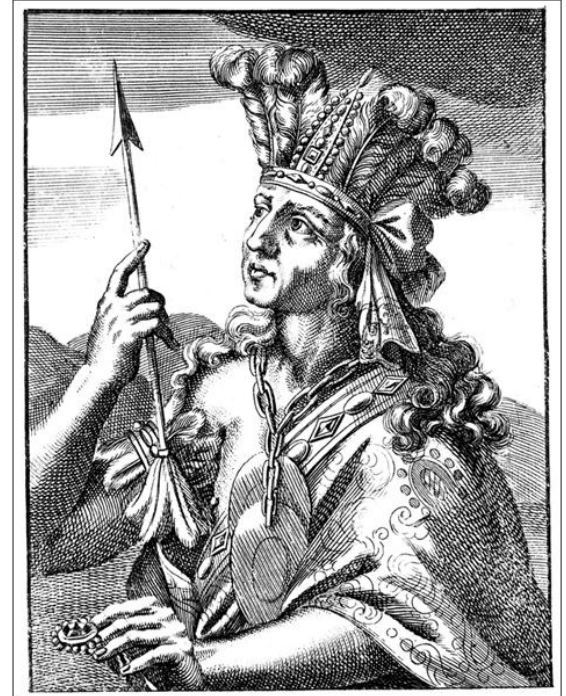
Incan legend says that the emperor was descended from Inti, the sun god. He was thus the “son of the sun.” Shown here is the last emperor to rule before the Spanish conquered the Inca Empire.

The highest-ranking nobles were the Capac Incas. Like the emperor himself, they were believed to be descended from Manco Capac, the legendary founder of the Incan dynasty.