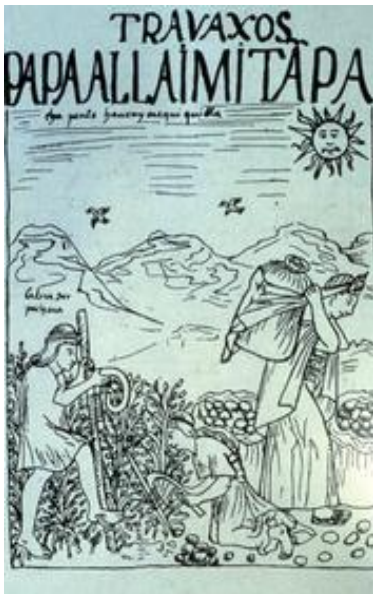
In this illustration, dating from about 1565, Incan farmers harvest potatoes.

Commoners Most people in the Inca Empire were commoners who worked as farmers and herders. The Incas did not practice slavery in the usual sense of the word. However, they did require commoners to support the government, both through the