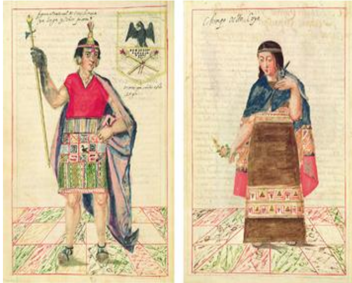
Incan couples agreed to marry by holding hands and exchanging sandals.

The children of most commoners did not receive any formal education. Instead, they learned the skills they needed, as well as Incan customs, from their elders. Some especially talented boys were trained in crafts or record keeping so they could serve the emperor.