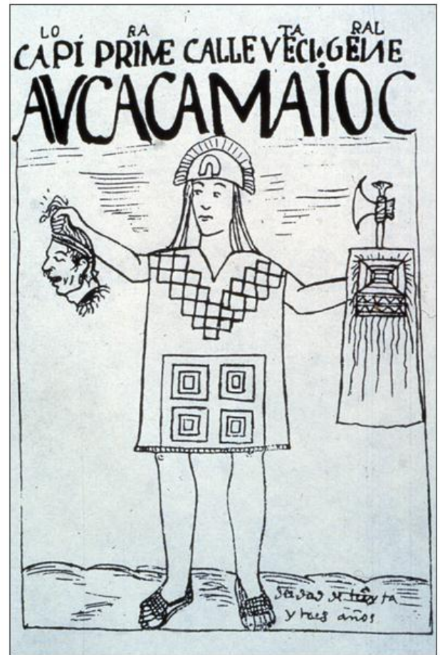
As the Incas expanded their empire, foreign tribes could choose to join the empire or face Incan warriors in battle.

Many historians have wondered what drove the Incas to conquer such a huge empire. Part of the answer may lie in a unique Incan belief. The Incas thought that even after death the Sapa Inca continued to rule the lands he had conquered. In order for the new emperor to establish his own source of power and wealth, he had to take new lands. Only then would he have land that belonged to him alone.