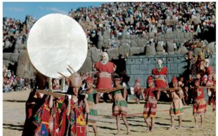
In this Incan festival held in honor of the sun god, Inti, men in traditional dress carry skeletons on platforms.

People usually married within their ayllu. Some marriages were arranged by families or by the young people themselves. In some cases, the local curaca chose a wife for a young man who was not yet married. When a couple