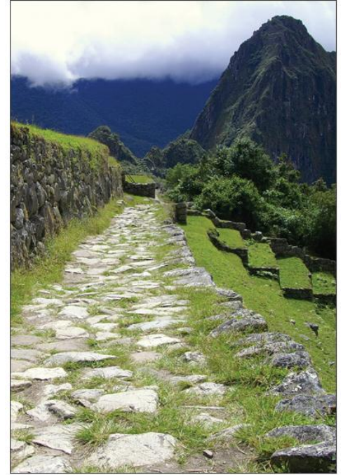
To maintain their large empire, the Incas developed an extensive network of roads, like this one leading to the Incan city of Machu Picchu.

You dart out of the messenger station and run alongside the other runner while he hands you a set of strings called a quipu (KEE-poo). Knots tied at different places in the strings stand for numbers. They will help you remember the message. The other chasqui also gives you a verbal message. Once he is certain that you have both parts of the message, he stops running. His work is over. Now it is up to you to get the message to the next station as quickly as possible.