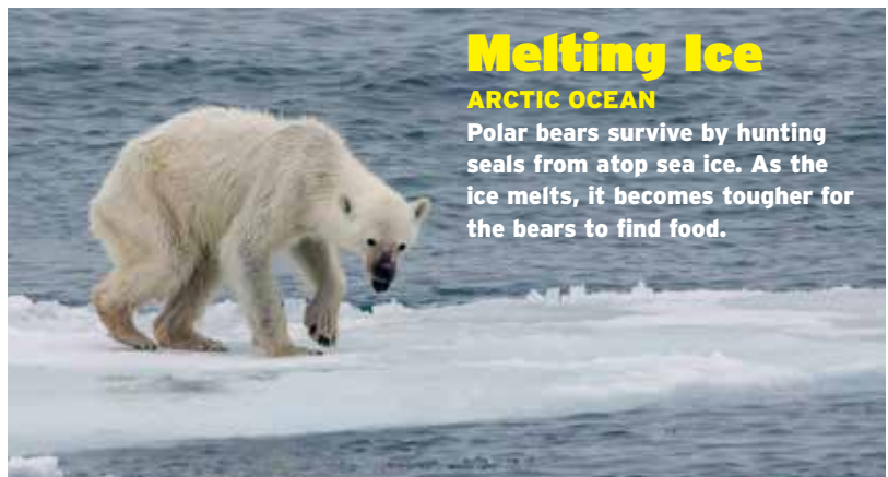
SW INFOGRAPHICS (DIAGRAM); JIM McMAHON (MAP)